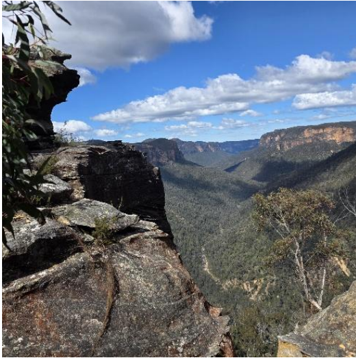
4. Grose Valey, Blue Mtns NP, Daniel Obando, Sept 2025