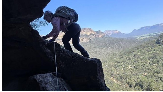
5. Approaching Coinslot Canyon, Paul Bowdler, Sept 2025