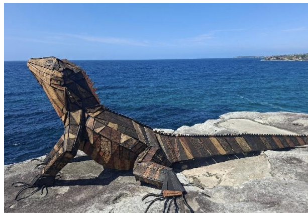
8. Sculpture by the Sea, Bondi area, Helen Toohey, Oct 2025