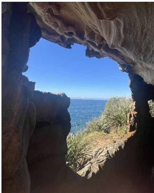
2. Royal NP, Aidan Basnett, Aug 2025