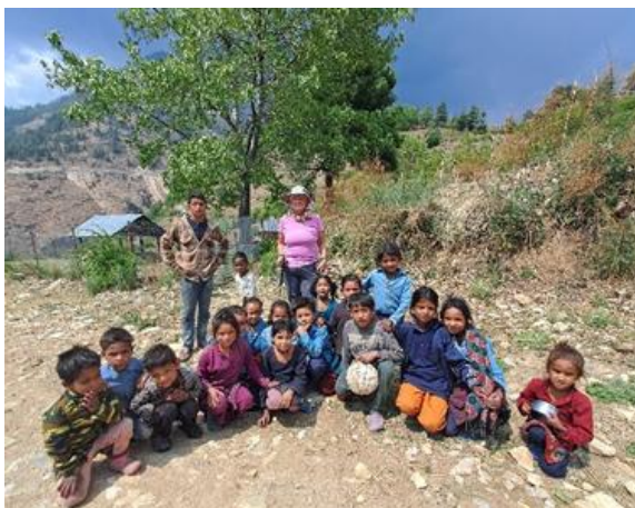
2. Meeting school children at Sinja