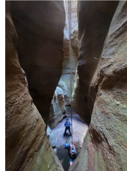
6. Coinslot Canyon, Paul Bowdler Sept 2025