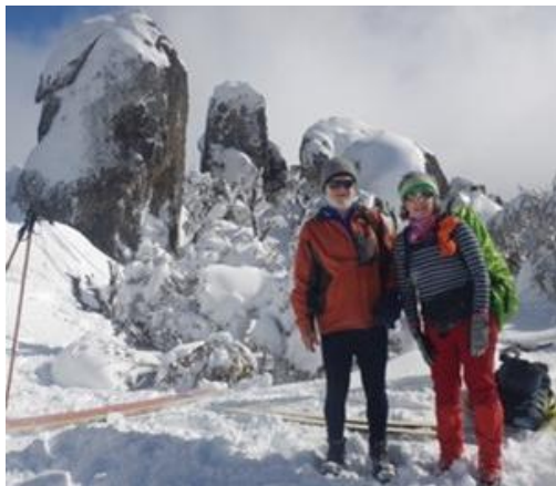
1. Porcupine Rocks

Read and see more about Louise and Peter's cross country skiing trips in 2025.