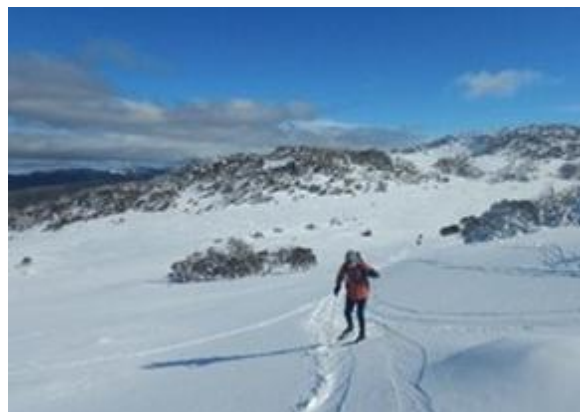
2. Return from Porcupine Rocks, Perisher trail