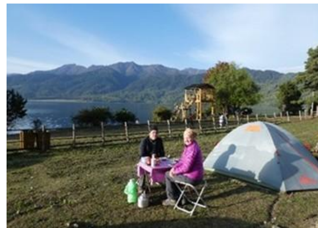
3. Breakfast by the lake