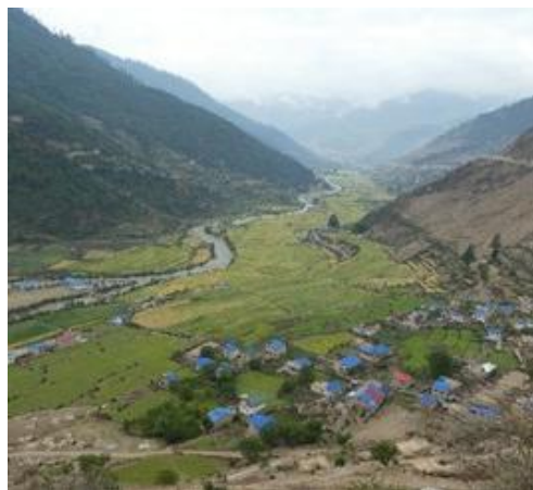
1. The beautiful Sinja valley

Read more about Lynda and Kim's Nepal adventure and see more photos and a great 25 minute video.