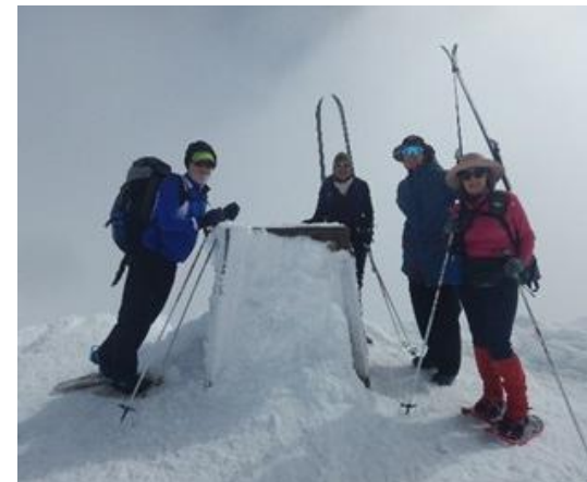
3. Atop Mt Kosciuszko