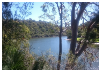
Upper reaches of Middle Harbour, Garigal NP (Jon G)

have been mutiny!). I found later that the proper topographic maps were much more reliable. A lesson I have learnt!